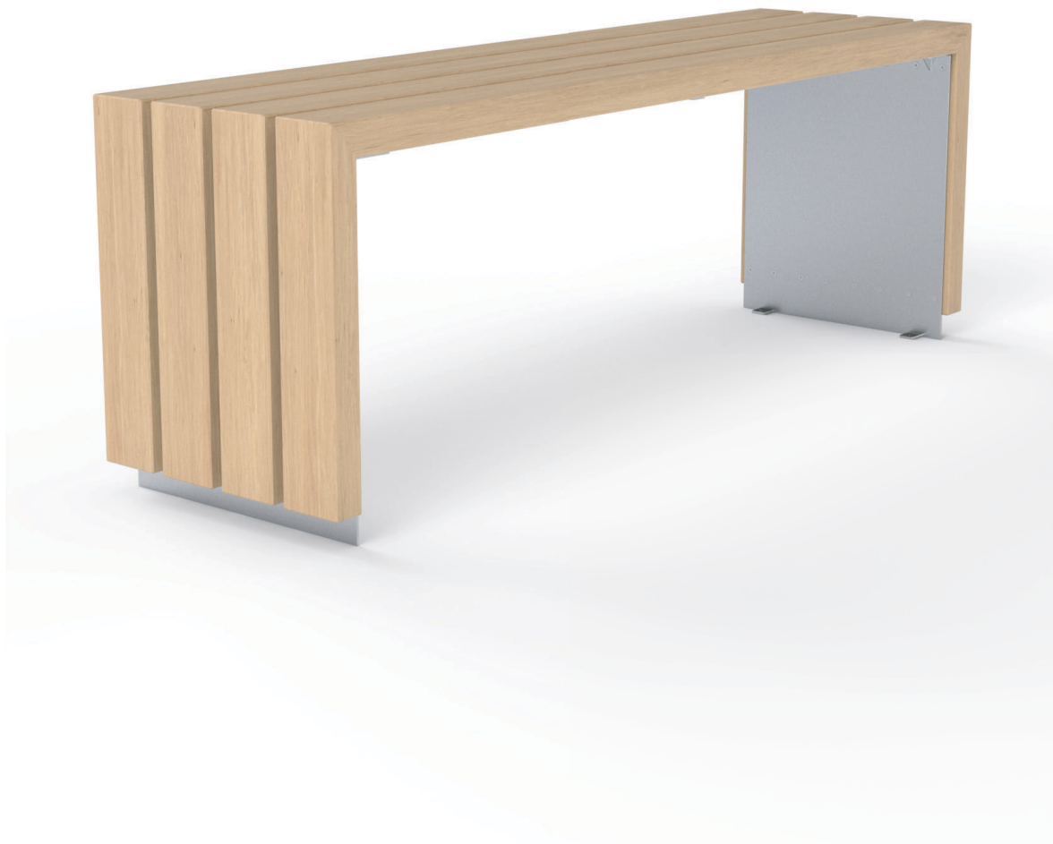
Bloc Wood Table