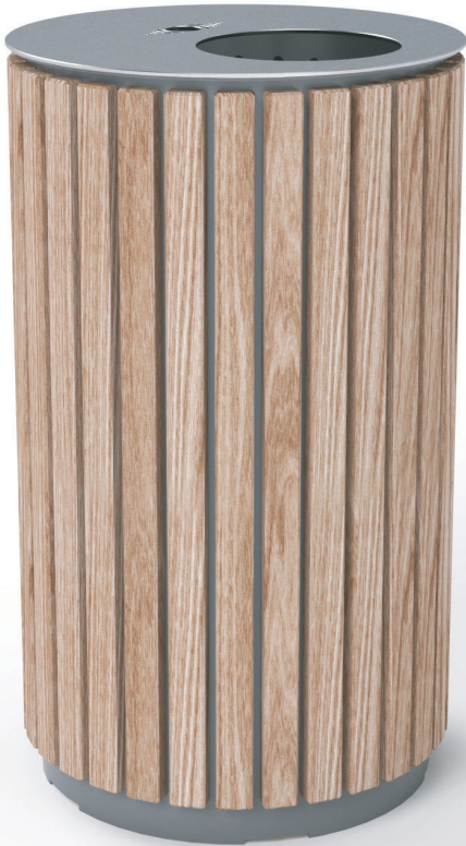
Boort Bin (Large)