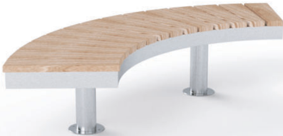
Chronos Bench - 90° Module