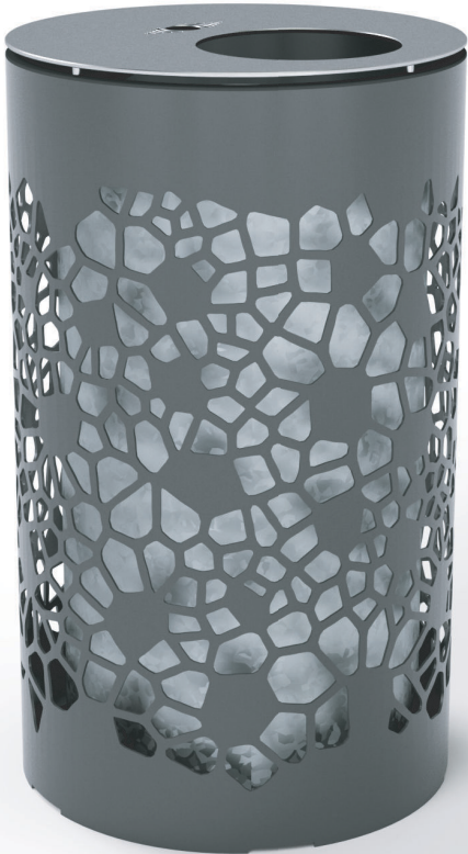
Osso Bin (Large)