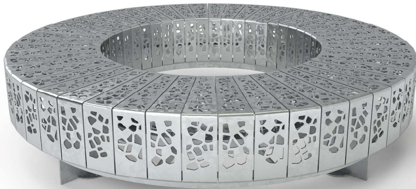
Osso Radial Bench (2.0m)