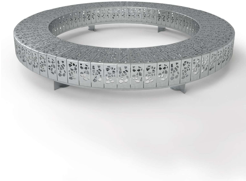
Osso Radial Bench (3.0m)