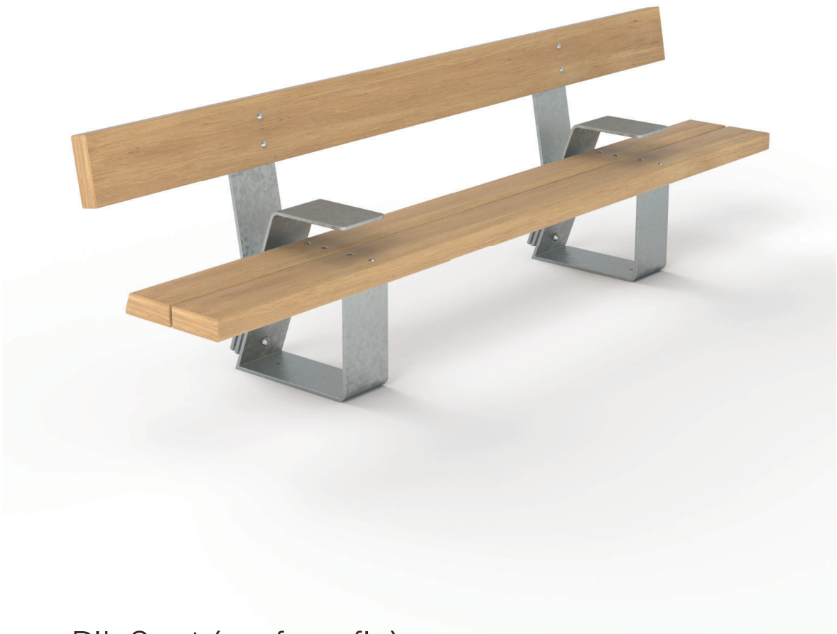
Pik Seat (surface fix)