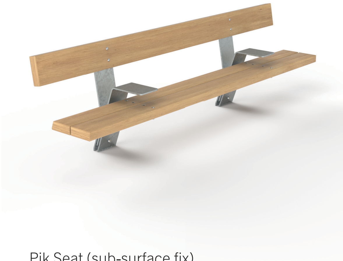
Pik Seat (sub-surface fix)