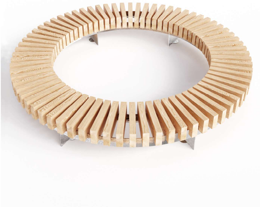
QUAY Radial Bench