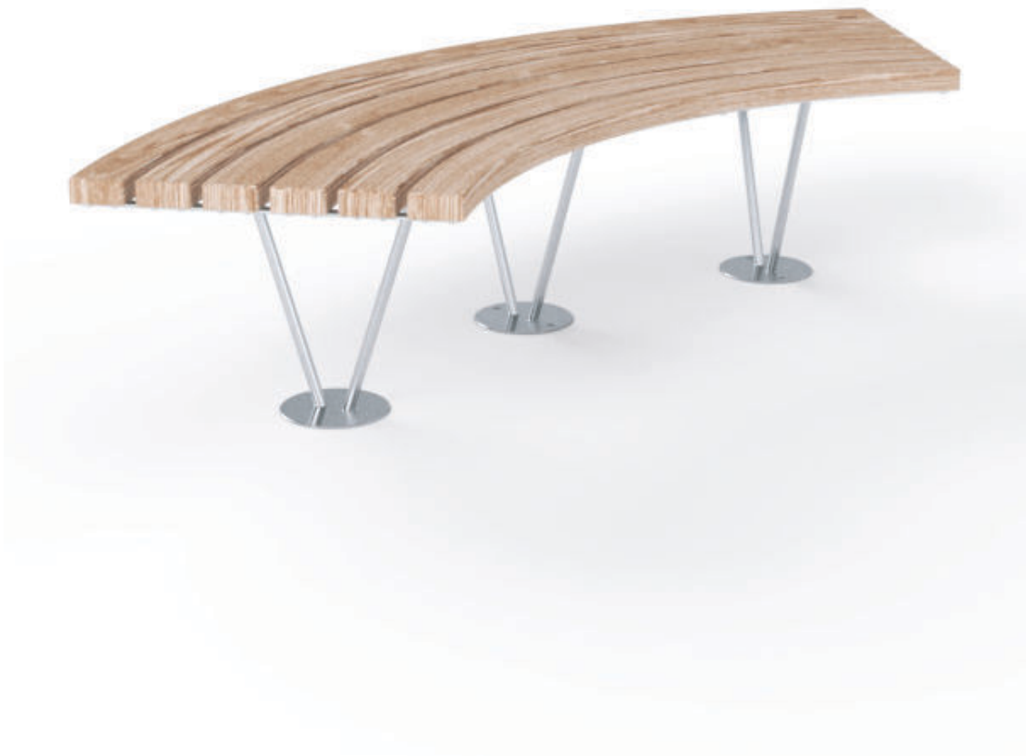
Sinu Bench - 72° Module