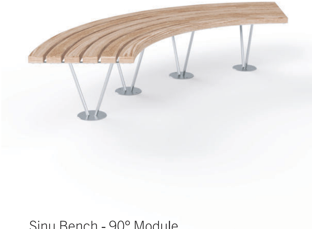
Sinu Bench - 90° Module