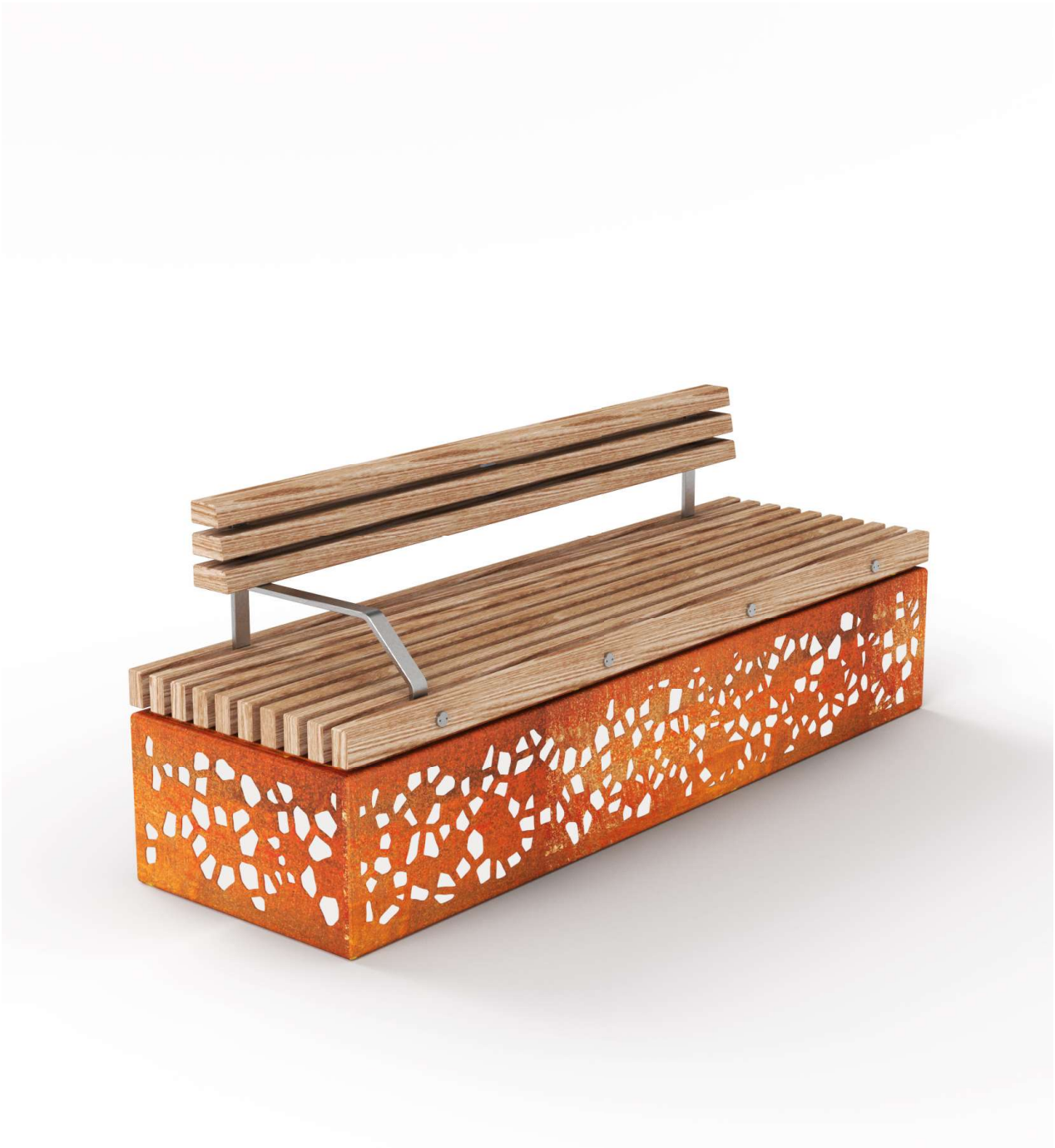
SOCA Illuminated Seat (2m)