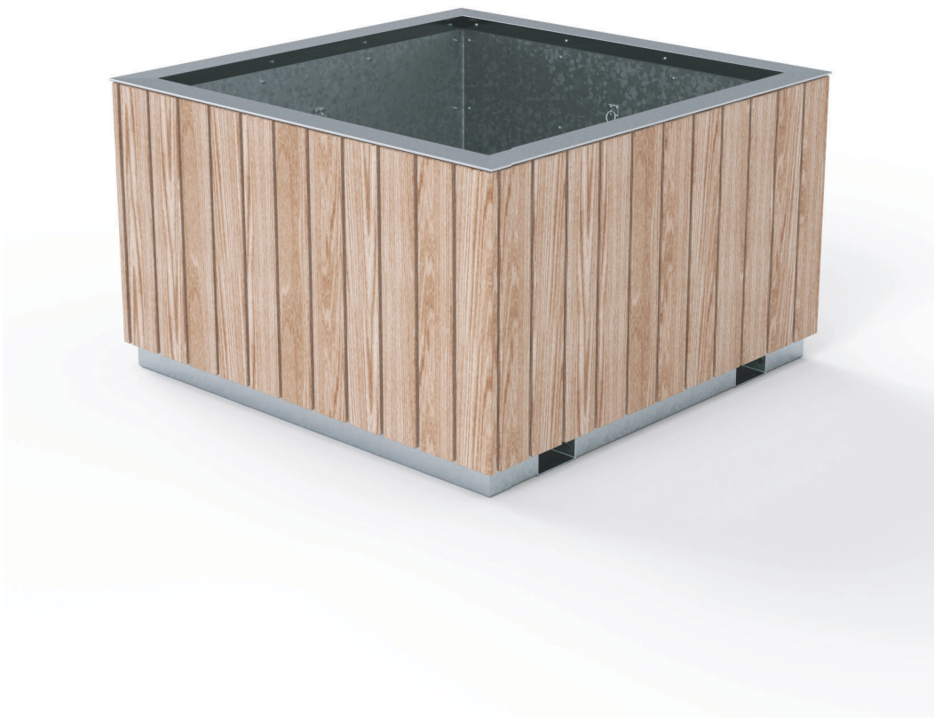
Tree Planter (1.5m)