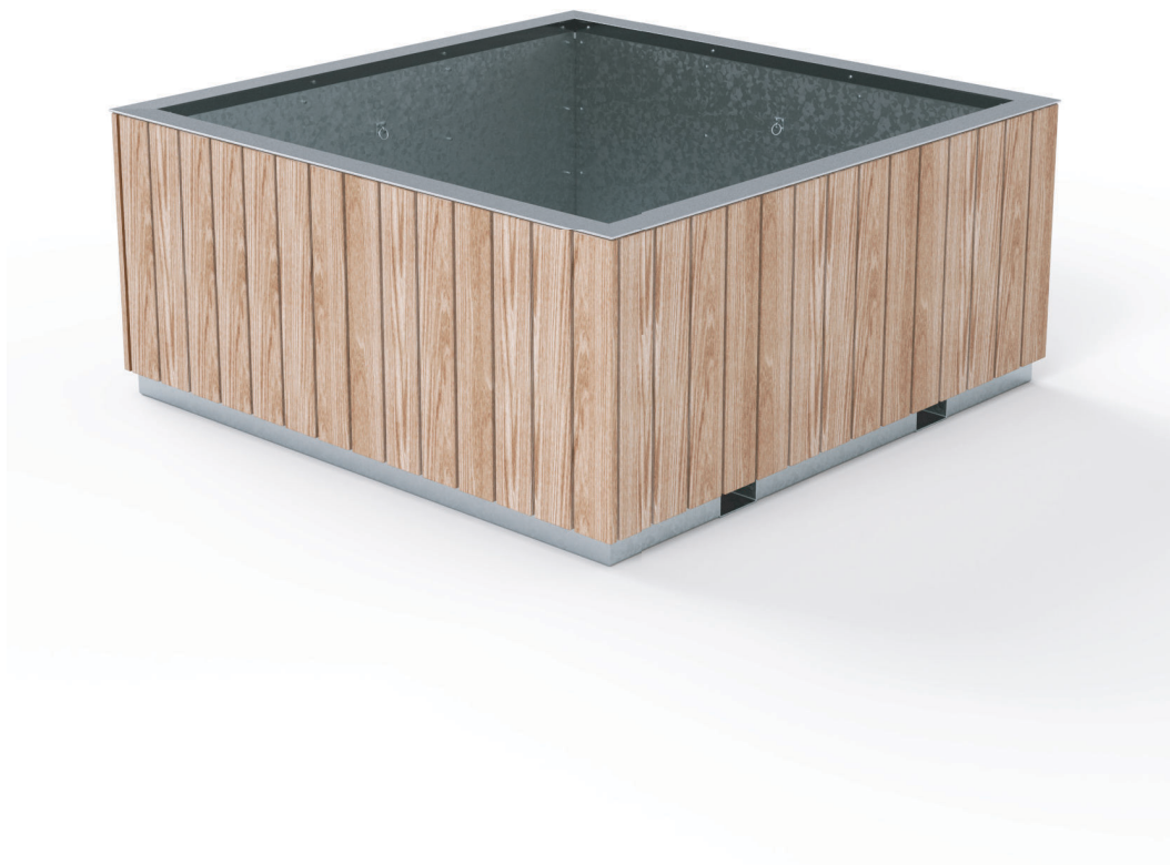
Tree Planter (2.0m)